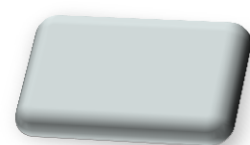
H (Ocean Grey)