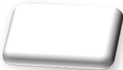
A Cool White