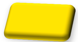
4 Sahara Sun