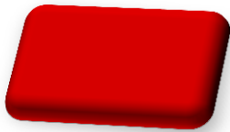
C Deep Red