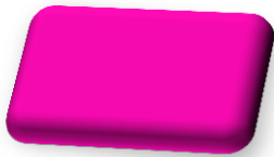
5 Ruby Red