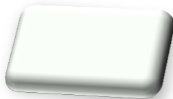
9 North White