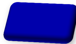
D True Blue