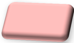
1 Coral Rose