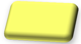
8 Golden Light