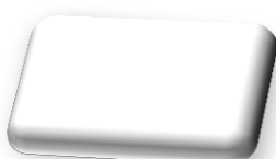
Pure White C003