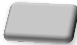
3 Smoke Gray