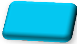
6 Sapphire Blue